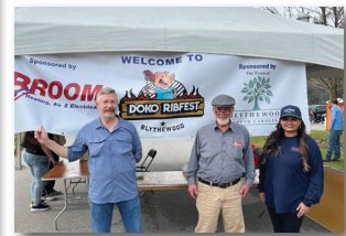
Members of the Scout Motors team volunteered at Doko Ribfest