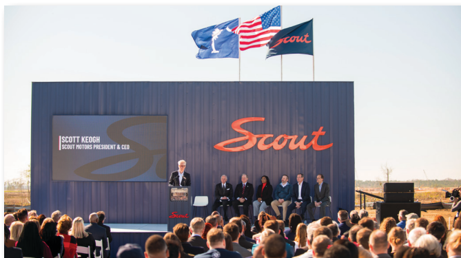
Scout Motors CEO Scott Keogh spoke from the construction site of the Production Center at a groundbreaking celebration on February 15.

We are now fully into the heart of the construction process for our Production Center, with all permits in hand and accelerated mass-grading taking place to level out around 850 acres of the site so that we can build on a flat surface. Soil stabilization is in process and we now have foundations for some of the first buildings.