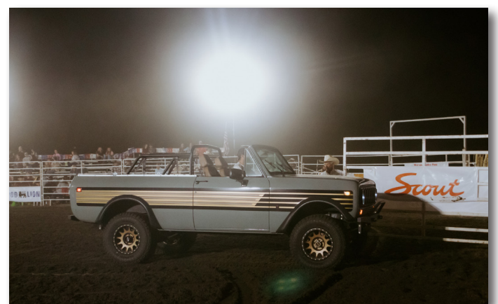
Scout Motors was the presenting sponsor of the Blythewood Fall Classic Rodeo in October.

We are excited to host, participate in and support more community events in the near future and look forward to making additional announcements about that soon.