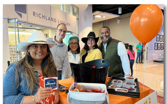
Scout Motors team members at Richland School District 2's annual Boo at 2 event.